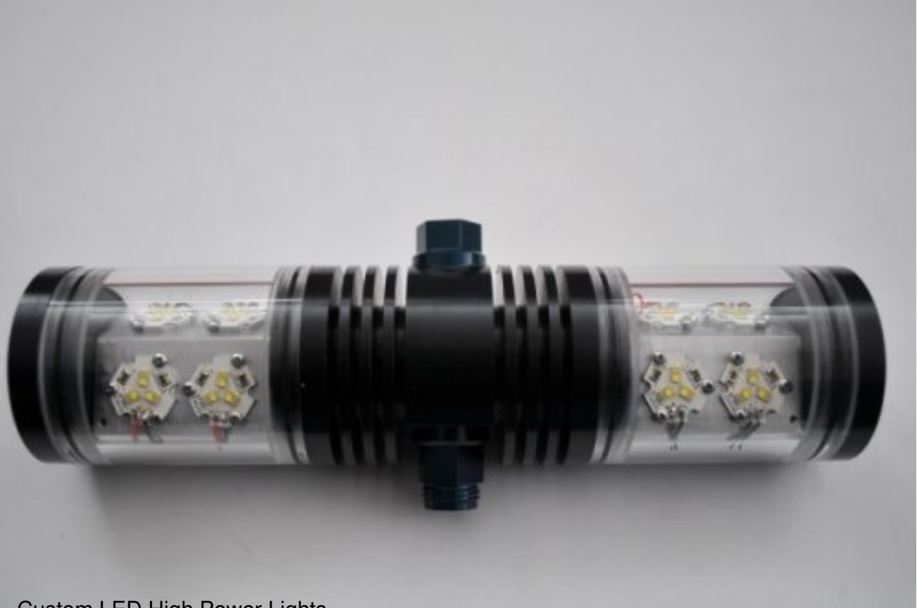
Custom LED High Power Lights