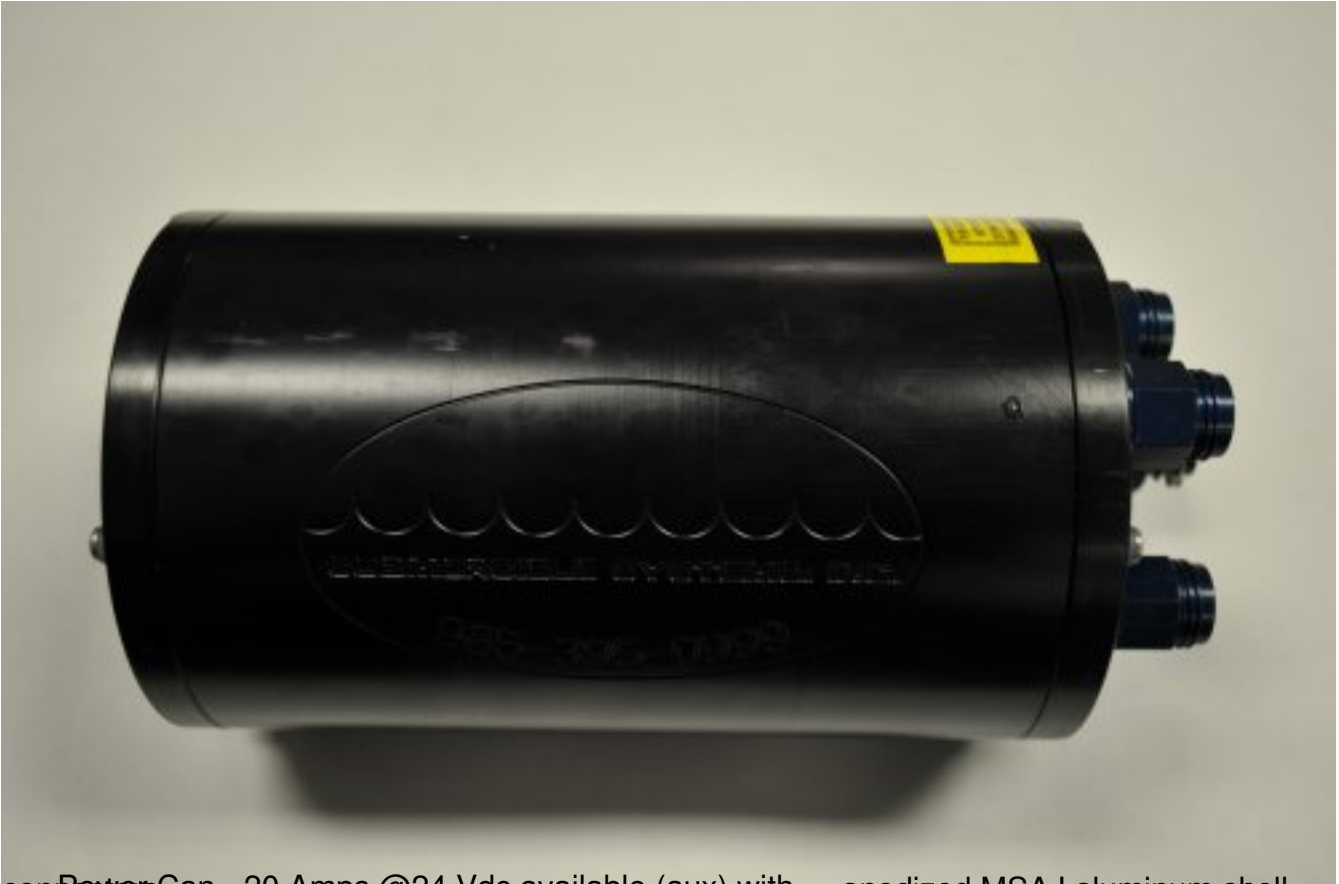
Power Can - 20 Amps @24 Vdc available (aux) with anodized MSA Aluminum shell