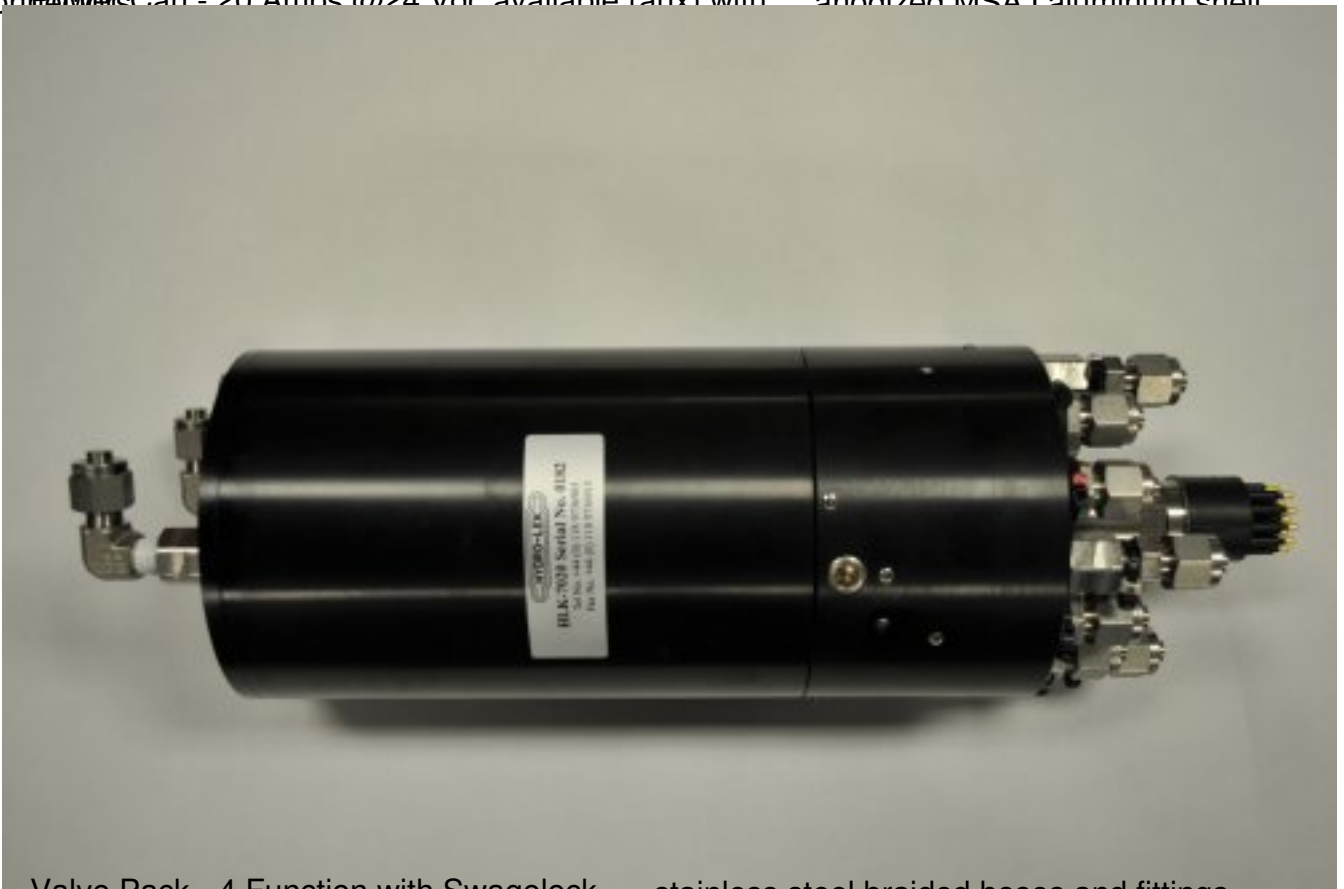
Valve Pack - 4 Function with Swagelock stainless steel braided hoses and fittings